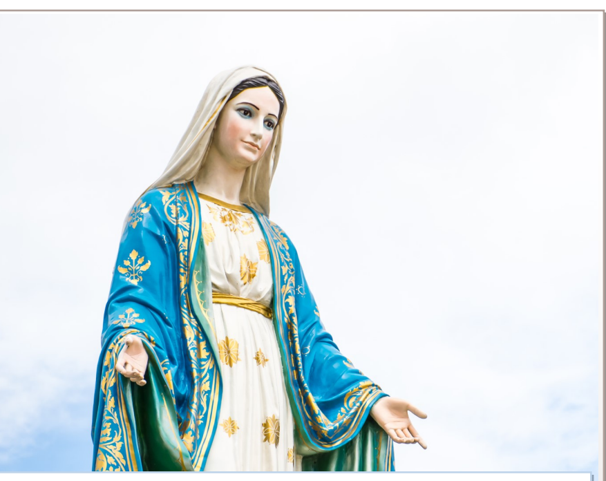
8<sup>th</sup> September The Nativity of the Blessed Virgin Mary

www.plenarycouncil.catholic.org.au/ fantheflame/